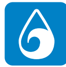
WATER — gallons —