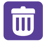
SOLID WASTE — lbs —