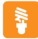
ENERGY — kWh —