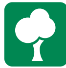
TREES — trees-e —