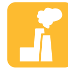
GHG — tonnes CO2-e —