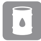
FOSSIL MATERIAL — barrels of oil-e —