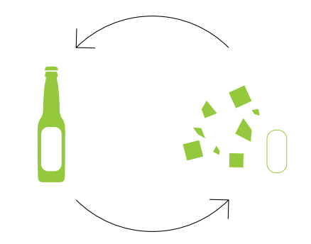
One way glass packaging: Glass Recycling

Labelling of one-way glass bottles and packaging, such as wine bottles and vegetable jars – to be collected via local glass recycling containers and bins.