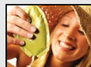
Polyester-Faced Cosmetic Web Light FlexPak™ Offering – page 52