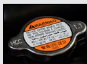
All-Substrate, Broad UL Fasson® S8025 Adhesive page 32