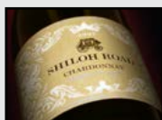
Sustainable Advantage Products page 29

RollXchange.com 800-211-2887 Financial Services 888-432-7766 Credit References Fax your request to 440-358-6032